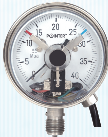
100mm Bottom Mtg Pressure Gauge with El. Contact