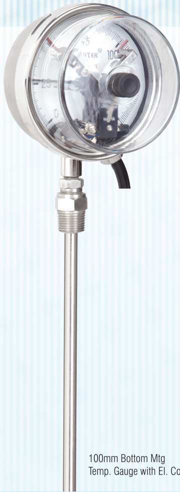
100mm Bottom Mtg Temp. Gauge with El. Contact

“POINTER” Electric contact gauges are suitable for the measurement & control of line pressure / Temperature by switching ‘ON & OFF’ electrical equipment which eliminate the need of separate switches for equipment.